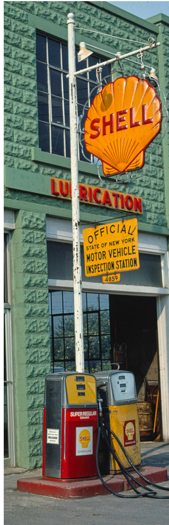
Shell Gasoline Sign, Walton, New York.

USA250 was instrumental in assisting in the drafting of federal legislation that created the U.S. Semiquincentennial Commission, helping to expand awareness of the importance of 2026 across many sectors and areas of the country. They have shifted focus to the second part of their mission, to promote Philadelphia as the leading destination for national and international visitors in 2026, along with creating lasting legacies for the city and region's residents. They are working with city and state stakeholders to move this vision forward.