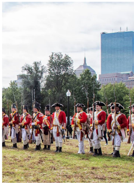
Revolution 250 event in Boston, Massachusetts.