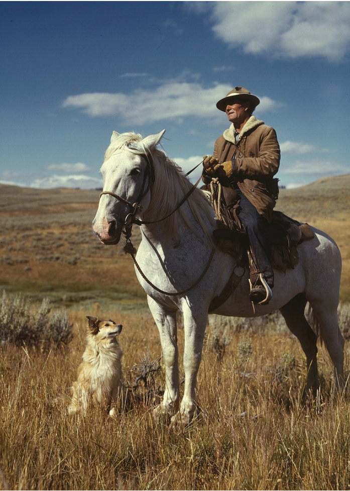
Shepherd with his horse and dog on Gravelly Range, Madison County, Montana.