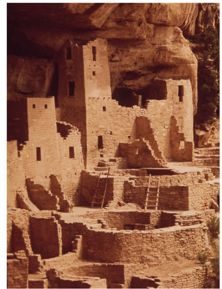
Ancestral Puebloan dwellings at Cliff Palace, Mesa Verde National Park.

With the help of our U.S. 250th Anniversary Task Force, conversations with partners across the field, and a survey of history organizations in every U.S. state and territory, AASLH has gathered the latest information about the current status of 250th anniversary planning and are pleased to share it with you in the pages that follow.