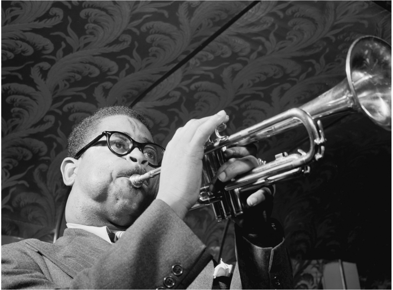
Jazz Musician Dizzy Gillespie, New York City, 1947.