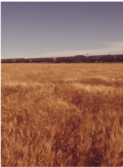
Wheat fields near Dodge City, Kansas, 1974.

How is the history community preparing for the 250th anniversary?