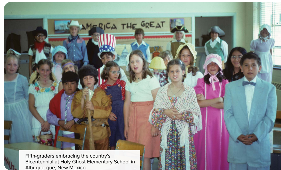
Fifth-graders embracing the country’s Bicentennial at Holy Ghost Elementary School in Albuquerque, New Mexico.

Like the American Freedom Train in 1976, museums, historic sites, and other cultural organizations in tens of thousands of communities across the nation will connect people to the 250th. People of all ages and backgrounds, in every state and territory, should see themselves and their communities in this shared history and cultural occasion, experiencing it locally. This path to 2026 can help us show audiences not just that history matters, but that their history matters.