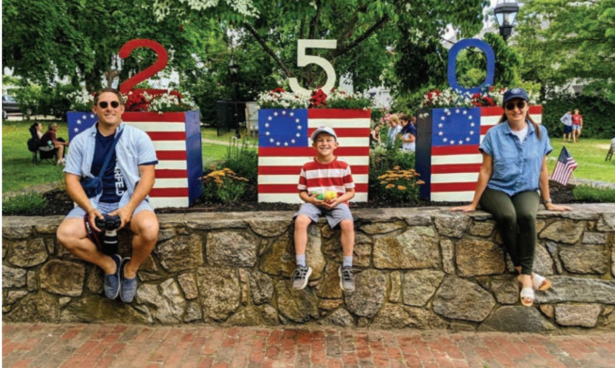
250th activities are opportunities to bring generations together (like the author and her family here) and work with local schools to create programming that meets their needs and standards.

History To-Go,” a catalog of living history professionals, their rates, and programming descriptions to make it easier for local museums, schools, and libraries to support local history professionals.