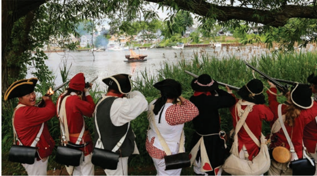
Events like reenactments can make history visible on the landscape and interest new audiences.