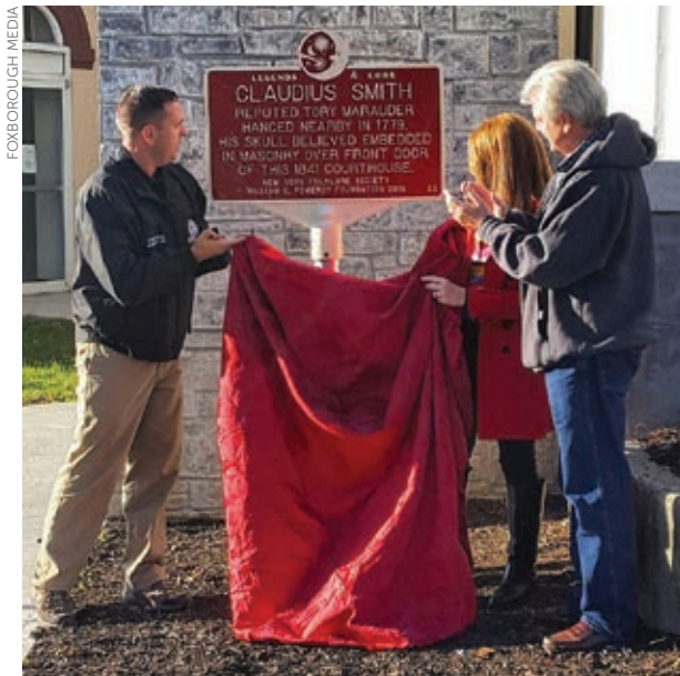
Commission projects can include researching and fundraising for new historic markers for your community.

Structure of Membership: The size of the commission can be based on a symbolic or practical number. This will differ greatly based on geographic region or density of participating institutions. Some might correlate the structure of the membership to the number of municipalities represented, or to the number of school districts. In Orange County, New York, these options would have yielded us too many members since we have 44 municipalities and 17 school districts. We chose instead to use the number 13 to symbolize the 13 colonies because it was manageable to organize that number of people into regular communication.