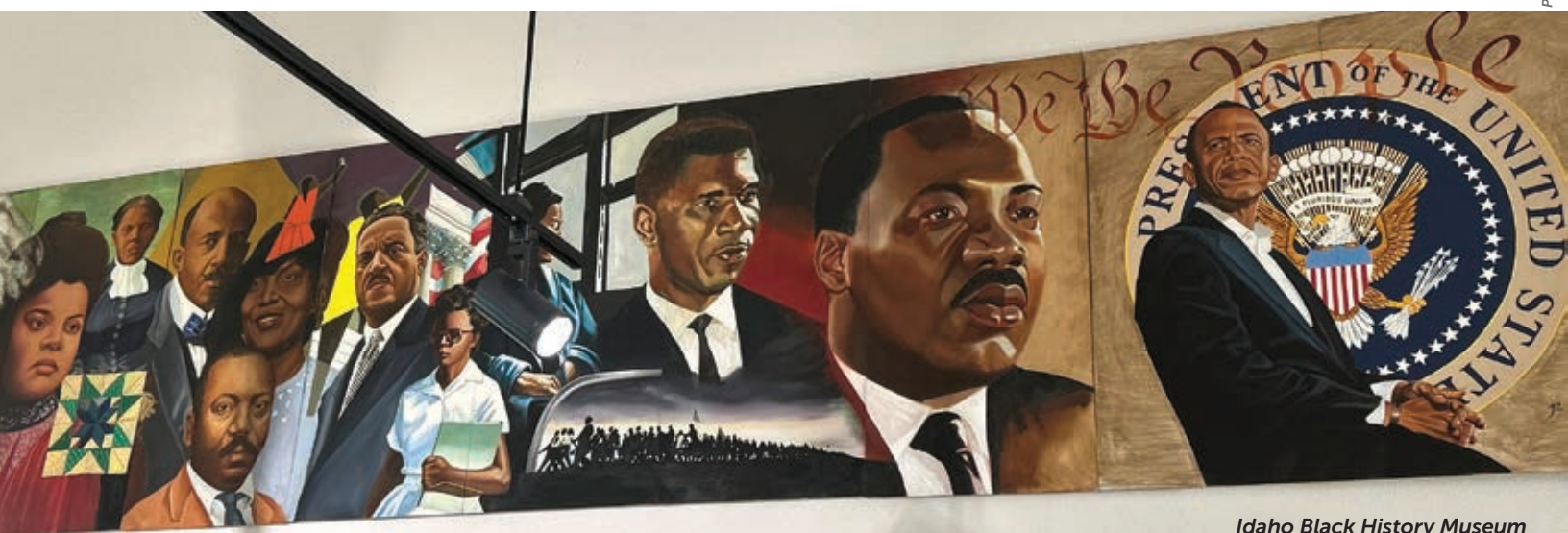
Idaho Black History Museum