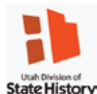
Utah Division of State History Salt Lake City, UT