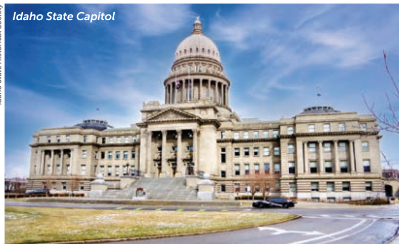
Idaho State Capitol

America's Cold War calculations relied upon military readiness and response. While other defense installations around the nation housed missile silos or submarines, the Strategic Air Command Ground Alert Facility at the Mountain Home Air Force Base was designed to have refueling planes and nuclear armed bombers in the air fifteen or fewer minutes after receiving a warning of incoming Soviet missiles. Tour participants will travel to the Mountain Home Air Force Base where they will tour the "Mole Hole," a semi-subterranean alert crew building constructed in 1958 and now under consideration for designation as a National