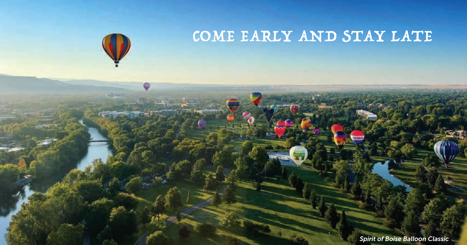
Spirit of Boise Balloon Classic