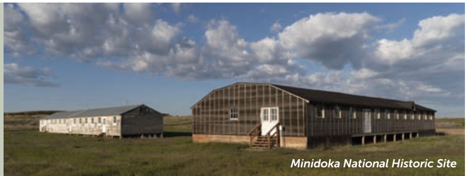
Minidoka National Historic Site

decided to highlight the experience of Japanese Americans during World War II with a visit to Minidoka National Historic Site. To accommodate as many AASLH attendees as possible who want to visit this site and reflect on this period of history, the full-day tour, Removal and Remembrance: Japanese American Incarceration in the Idaho Desert , will be offered twice during the conference, once on Wednesday and once on Saturday. Please register early if you want to participate. Details are on page 16.