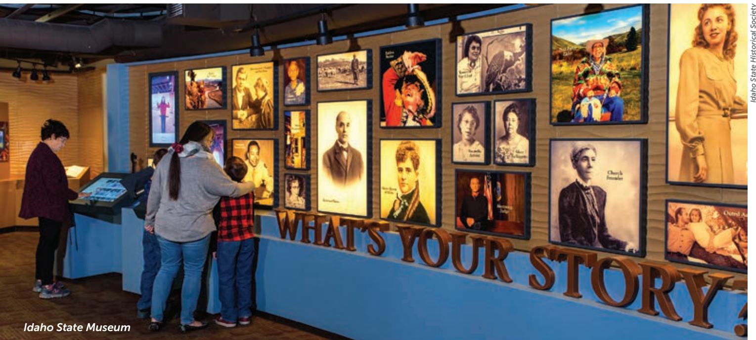
Idaho State Historical Society