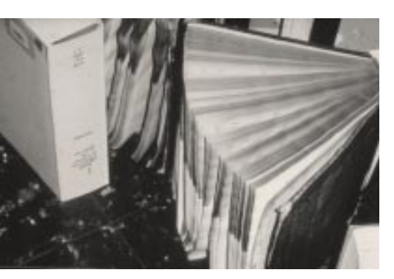
Air-drying book. Note the characteristic cockling of pages and tideline discoloration.

Fourth, prepare a written emergency response plan. A written emergency plan is essential for every institution. The plan should begin with step-by-step procedures to protect staff and visitors in case of any unforeseen event, including power failures, medical emergencies, security emergencies, and damage (small- or large-scale) to the facility. The second section of the plan should discuss recovery procedures for staff including damage assessments, inventorying of damaged materials, contracting services, and risk management—with responsibilities