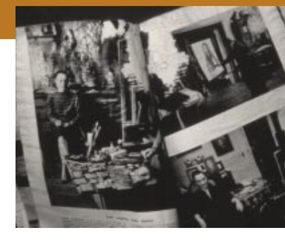
Glossy (coated) paper "blocked" by wetting and drying cannot be separated without tearing.

Throughout the dehumidification drying operation, thoroughly check the shelves.